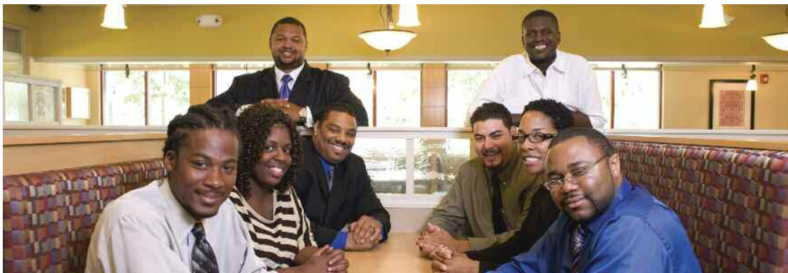
Owners and management of IHOP